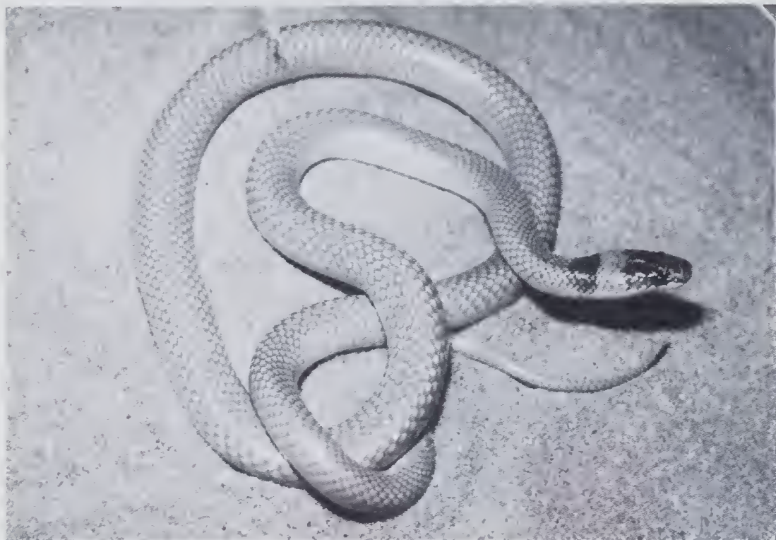
Fig. 1: A Furina ornata from Woodie Woodie.